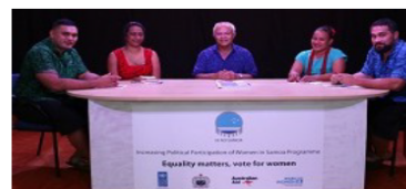
The roundtables are part of a project to increase political participation of Women in Samoa (IPWIS), sponsored by UN Women and UNDP, in collaboration with the Centre for Samoan Studies at NUS, 2019.