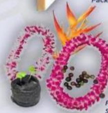
Fresh Flowers, Seeds