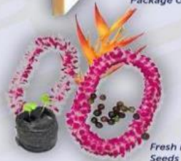
Fresh Flowers, Seeds