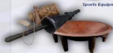
Handicrafts, Carvings (Wooden/Bone)