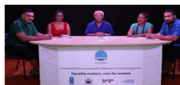
The roundtables are part of a project to increase political participation of Women in Samoa (PPWS), sponsored by UN Women and UNDP, in collaboration with the Centre for Samoan Studies at NUS, 2016.