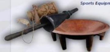
Handicrafts, Carvings (Wooden/Bone)