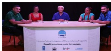
The roundtables are part of a project to increase political participation of Women in Samoa (IPWIS), sponsored by UN Women and UNDP, in collaboration with the Centre for Samoan Studies at NUS, 2016.