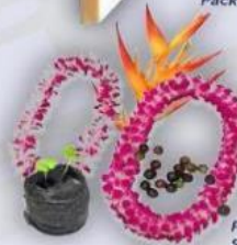
Fresh Flowers, Seeds