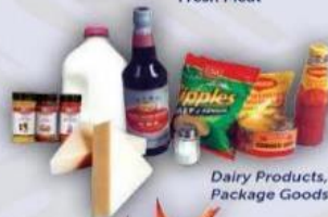
Dairy Products, Package Goods