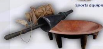
Handicrafts, Carvings (Wooden/Bone)