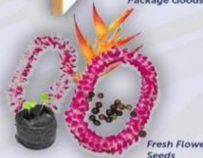
Fresh Flowers, Seeds