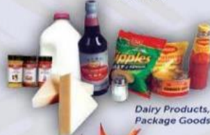
Dairy Products, Package Goods